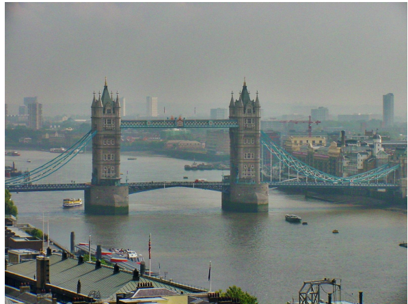
Figure 3: Original images (left) and images dehazed using Galdran -et al.- method [4].