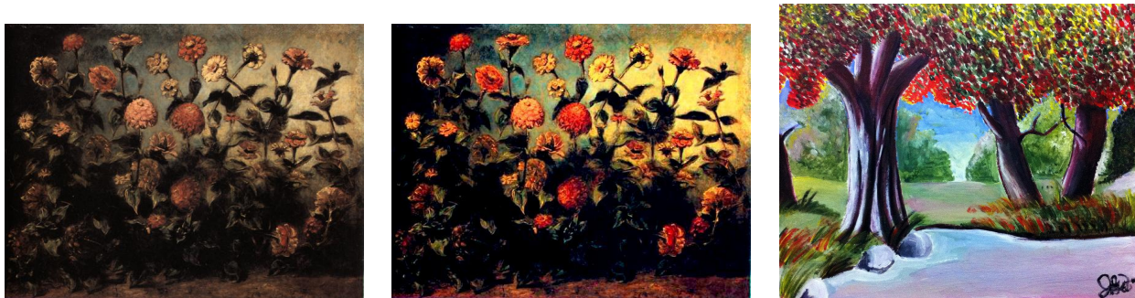
Figure 2: Original image (left), target image (right), and the result of the color modification performed by [17](center).